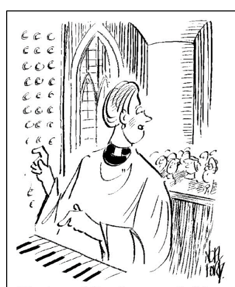
"Due to our failure to secure a holidayrelief organist, the next hymn will also be sung to the tune, Chopsticks ."

That Sunday is also the last Sunday before the choir breaks up for the summer. This long break is really important for the choir's well-being. The commitment given by our choristers and their families is much bigger than people sometimes realise. Friday evenings are taken up with choir practice and there are no weekends during the term for visiting family or friends. When there is Choral Evensong at 6 pm it can seem that most of Sunday is spent going back and forth to and from church. And 6 services within 8 days between Palm Sunday and Easter is a big haul. Of course, no one in the choir really minds doing all this – it is part of the choir commitment, and the rewards are immense and make it all worthwhile.