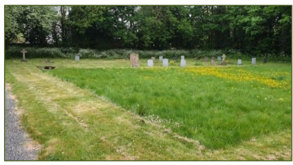
The wild flower meadow in the churchyard where in the summer, we have our plant sale (May 14, 10.30am to 12.30pm); and delicious cream teas (July 24 at 3.00pm);

By working together (at an acceptable social distancing of course), we started to reveal a row of graves beneath the large yew tree at the West end of the church. These all belonged to a family, no longer represented in the village, with grandparents, parents and even an infant daughter, all buried in a row. Once uncovered, some bark chippings were added to suppress the weeds, and here is what it looks like now!