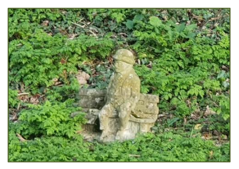
and our man keeping watch.