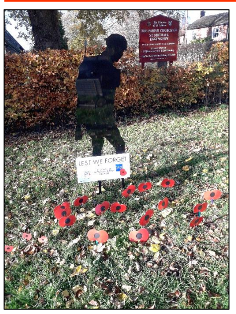
They shall grow not old, as we that are left grow old: Age shall not weary them, nor the years condemn. At the going down of the sun and in the morning We will remember them.